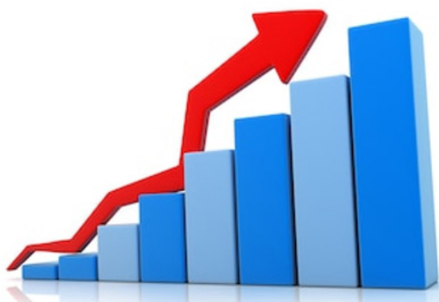
Fig. 1. Increasing interest in the continuous professional training of primary school teachers in the field of inclusive education.

In the framework of my scientific research among the respondents who participated in the scientific experiment, I noticed a maximization of interest in the continuous professional training in the field of inclusive education of teaching staff in mass education, because in mass education institutions there are more and more several cases of students with different special needs, and in order to satisfy their needs, it is necessary to train them, as well as to accumulate the 90 transferable credits that each teacher must have during five school years, called five-year, provided in Order no. 5561/2011, art. 4, (a), [9], but also following the completion of teaching degrees II and I, university studies, professional conversion or specialization in another field of license, provided in Figure no. 1.